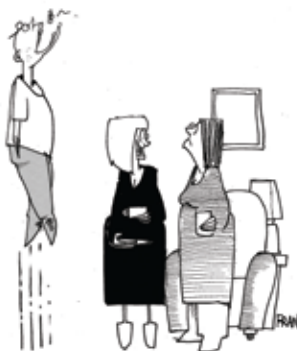
I DON'T KNOW WHETHER THE FISH OILS HAVE HELPED HIS CONCENTRATION, BUT THEY'VE CERTAINLY HELPED KEEP THE FLY POPULATION DOWN