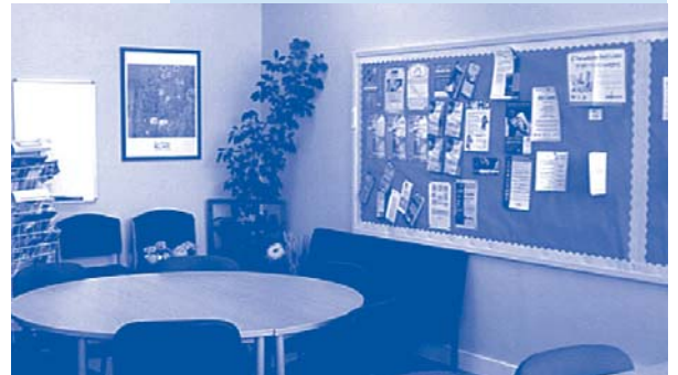
Our meeting room in Bedford is a quiet, private room where we hold monthly surgeries and can offer appointments to talk with parents.

To find out more, please phone 01234 316353.