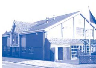
The Salvation Army Centre, Dunstable