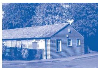
The Lawns Early Excellence Centre, Biggleswade